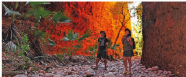
Marvel at the vast wonders of Echina Chasm