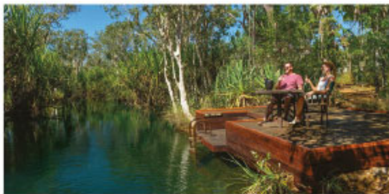
Relax on the deck by the waterhole at Mitchell Falls Wilderness Lodge