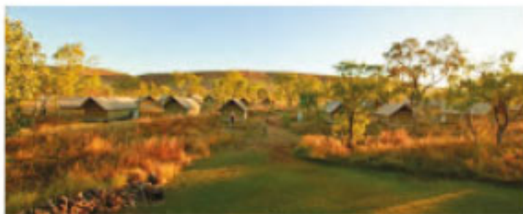
The stunning bush scenery provides a beautiful backdrop