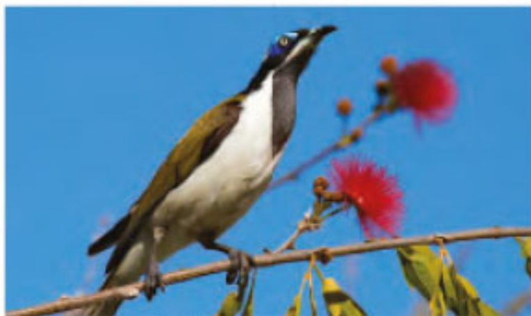
Get up close to magnificent birdlife