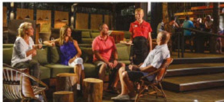
Enjoy the relaxed atmosphere of the Ungofan Pavilion

All of our lodges have a liquor license, which enables you to purchase beer, wine and spirits if you choose. Alcohol cannot be brought into the lodges with you.