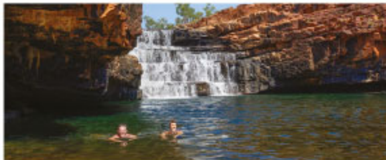
Enjoy a refreshing swim beneath the cascading waterfall at Bell Gorge

This booklet is designed as a guideline to assist you when preparing for your tour. Much of the information within is subject to change and while all care has been taken to ensure all information is correct at time of printing, we cannot take responsibility for any subsequent changes. PUBLICATION No. H5089. Printed in Australia. Effective 1 April 2018. Australian Pacific Touring Pty Ltd (ABN 44 004 684 019. ATAS accreditation #A10825)