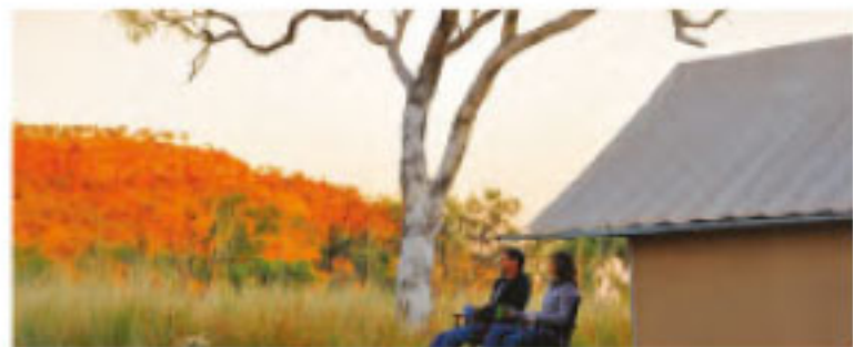
Watch the sun set from your deck at Bell Gorge Wilderness Lodge

Please note: Statistics are a guide only as Australian weather can be unpredictable.